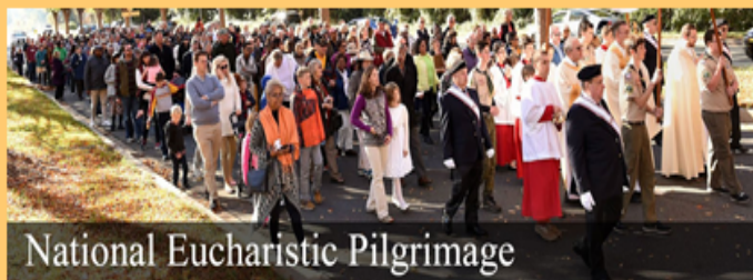
National Eucharistic Pilgrimage

We are thrilled to welcome you to the upcoming National Eucharistic Pilgrimage , which will travel through the Archdiocese of Washington from June 7 – June 9, 2024.