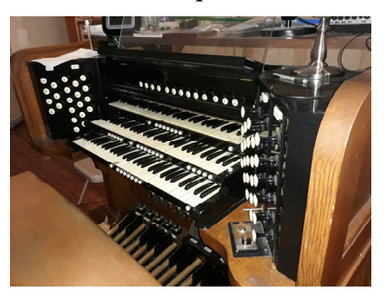
Roosevelt Organ Rededication Concert & Reception