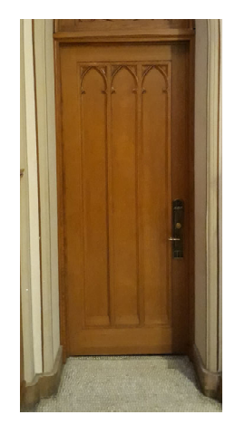
Current Frontage Rd. door.