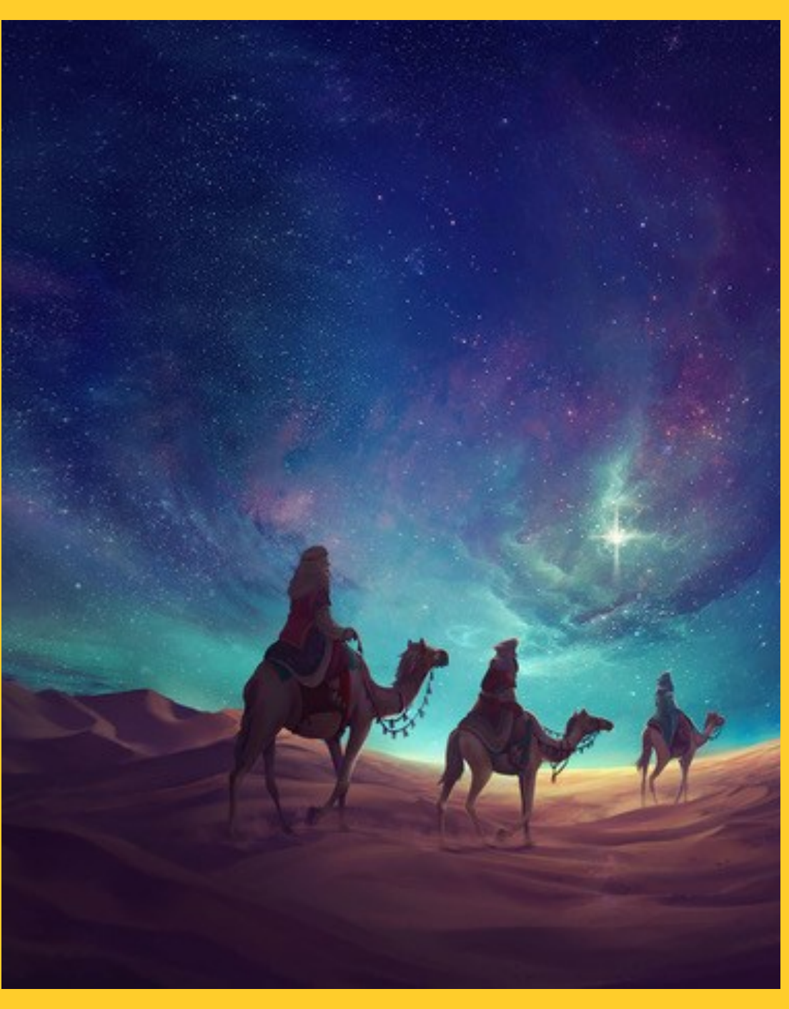
JANUARY 6, 2019