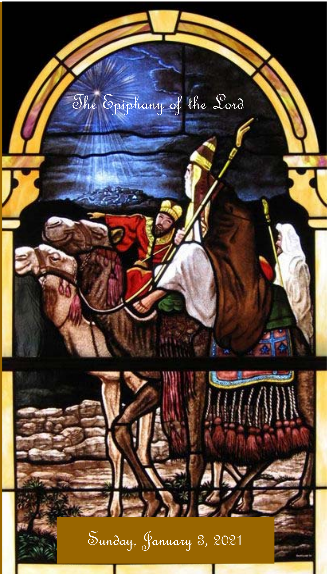
The Epiphany of the Lord