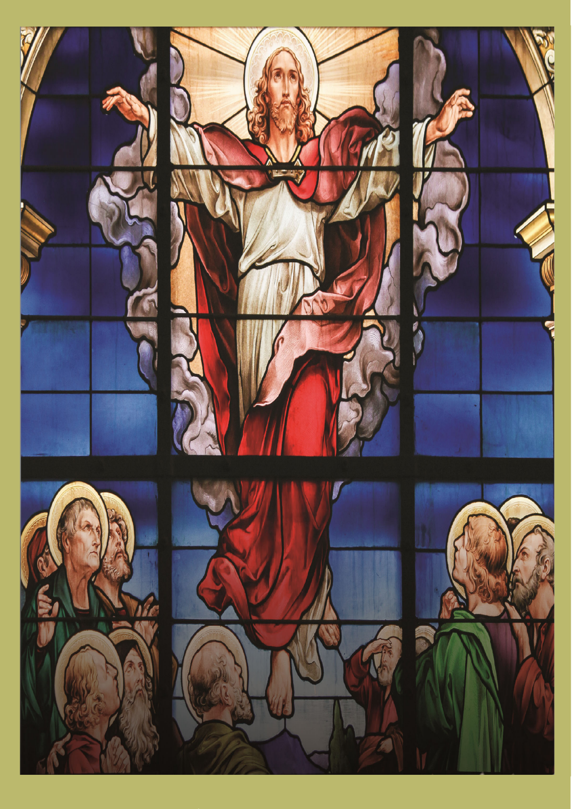
Sunday, May 16, 2021