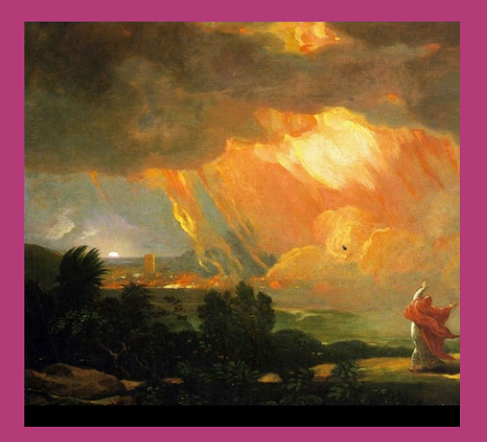
Serving Southwest Washington since 1852