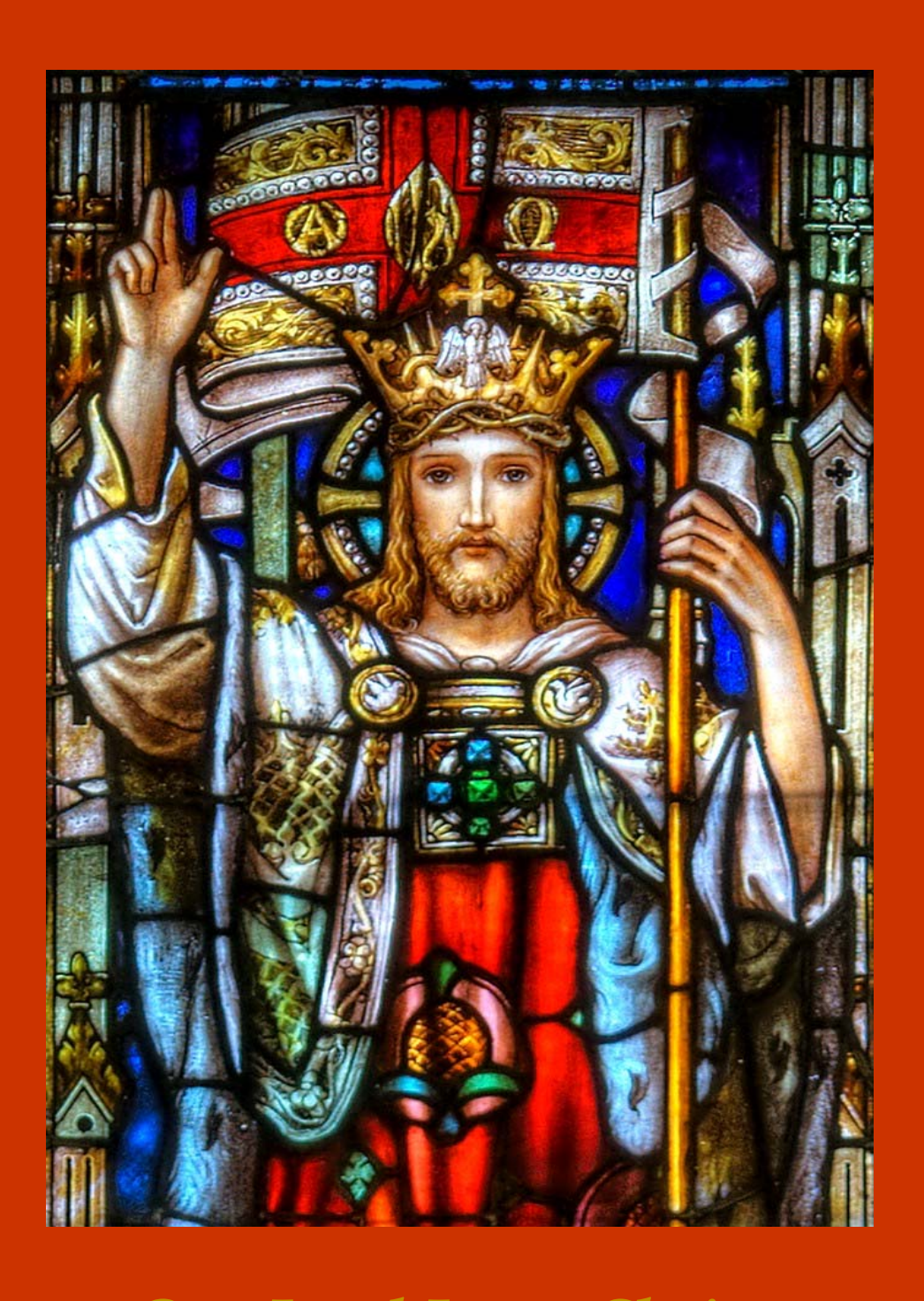
Our Lord Jesus Christ, King of the Universe